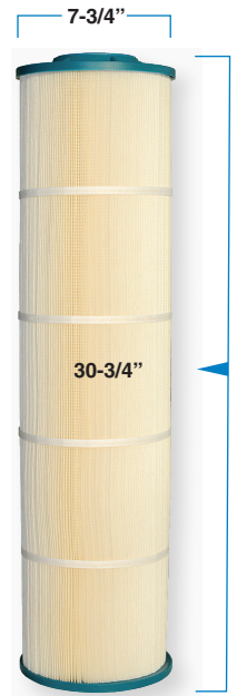
Hurricane® Cartridge Length and O.D.

Flow rates shown above are for guidelines only. Actual flow rates are based on cartridge type, micron rating, viscosity, solids content and various other factors. For complete flow and pressure and pressure drop information, please refer to your cartridge manufacturer guidelines.