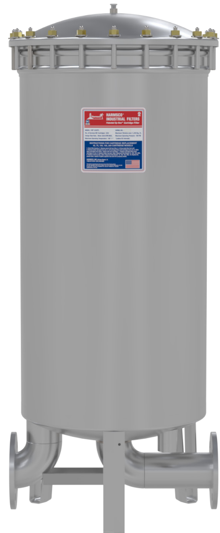
HIF 3X170FL T-316L BABA