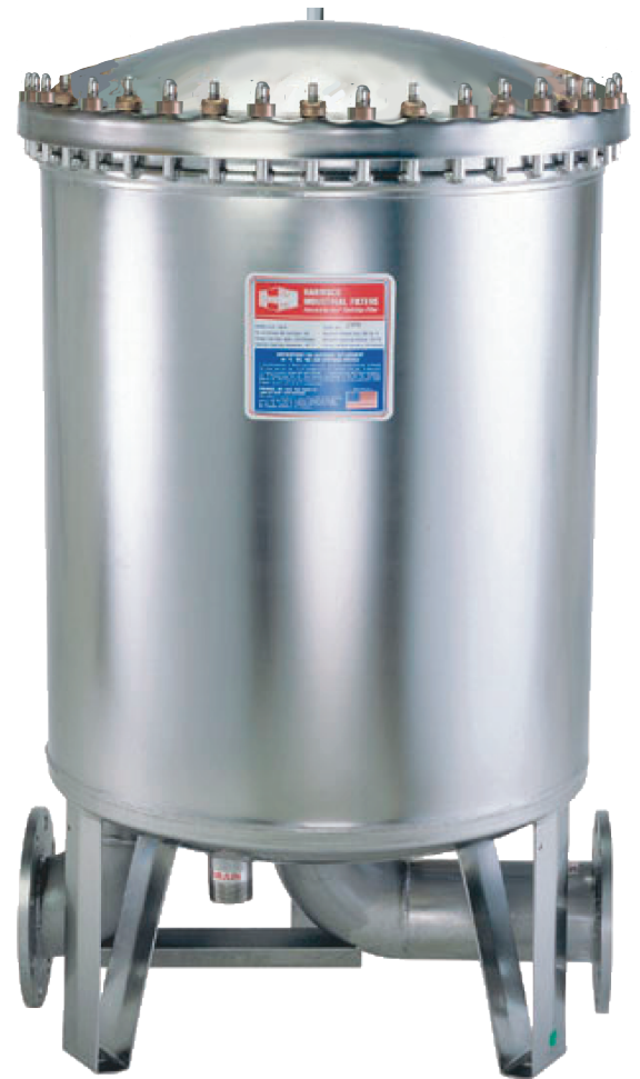
HIF 5X170FL T- 316L BABA