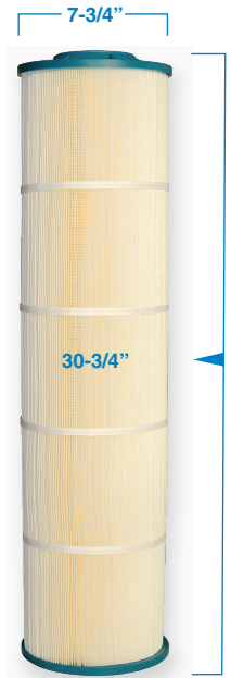
Hurricane® Cartridge Length and O.D.

Flow rates shown above are for guidance only. Actual flow rates are based on cartridge type, micron rating, viscosity, solids content and various other factors. For complete flow, pressure, and pressure drop information, please refer to your cartridge manufacturer guidelines.