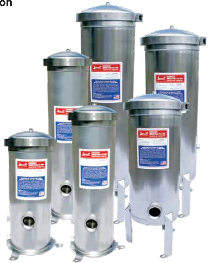
Models BC4-1, BC4-2, BC4-3, BC6-1, BC6-2, BC6-3