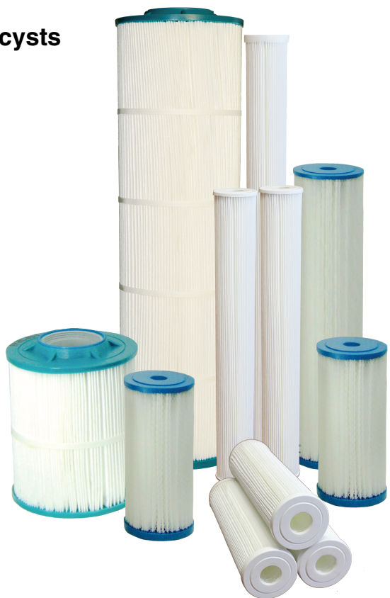
Harmsco® Microfiber Series Cartridges