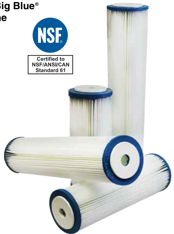
Harmsco® SureSeal™ Series Cartridges