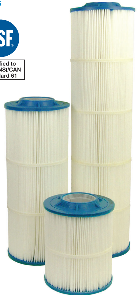
Premium Hurricane® Harmsco-Free Cartridges