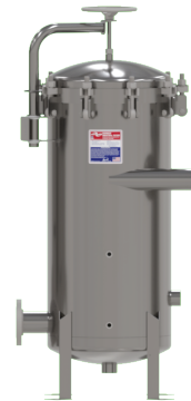
HUR 3xBAG SB