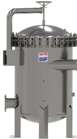
HUR 8xBAG SB