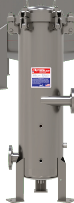
HUR 1xBAG SB