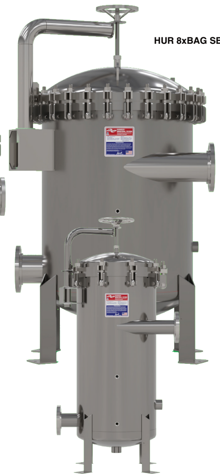
HUR 8xBAG SB