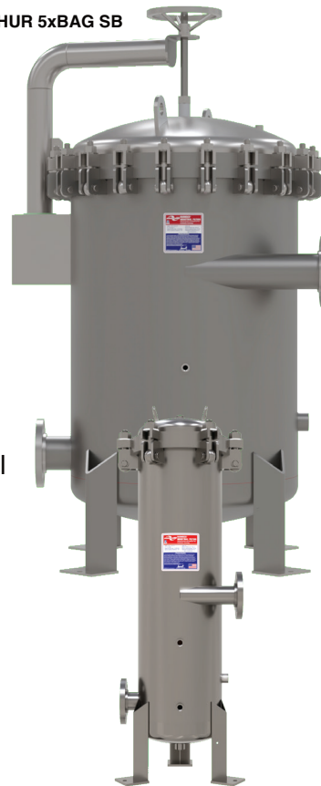
HUR 5xBAG SB