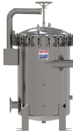
HUR 5xBAG SB