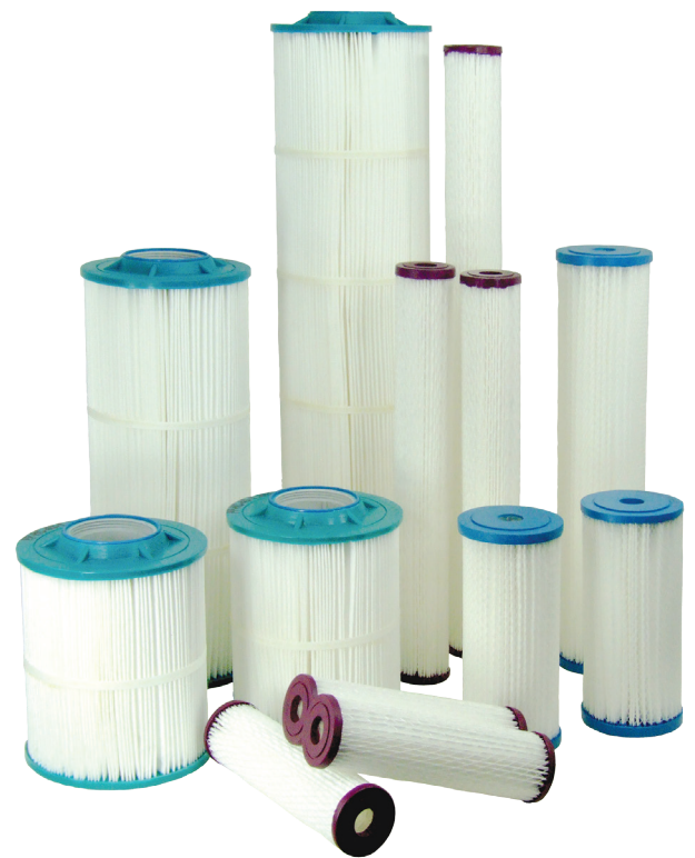
Harmsco® Poly-Pleat™ Series Filter Cartridges

*Big-Blue is a registered trademark of Plymouth Products, Inc.*