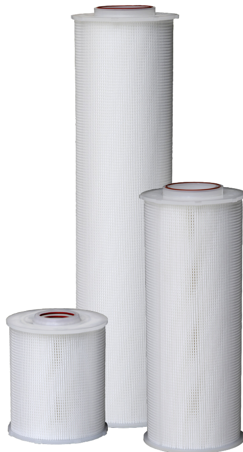
Premium Hurricane® All-Poly Cartridges