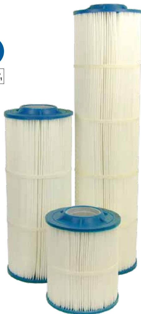
Premium Hurricane® Harmsco-Free Cartridges